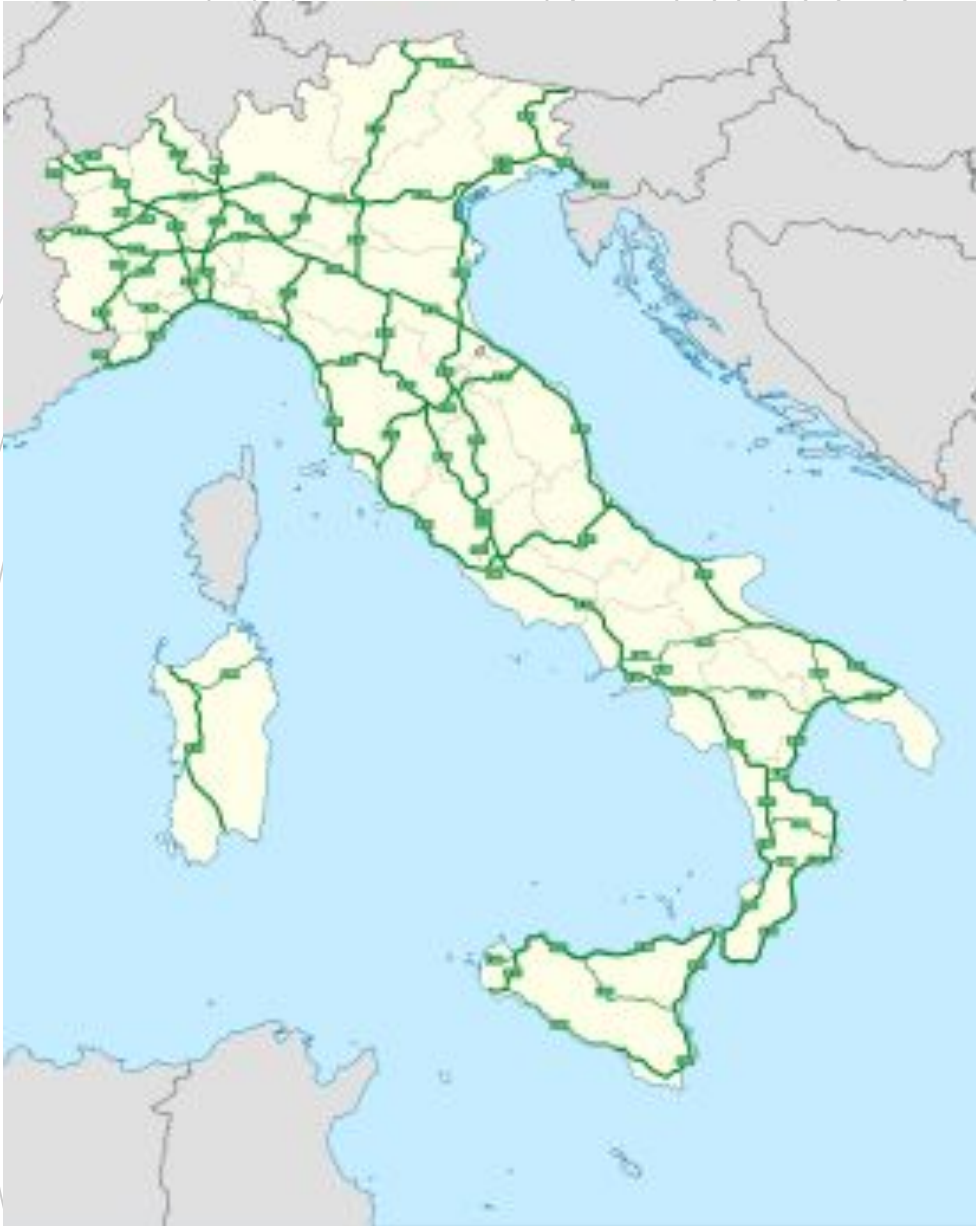
E road network