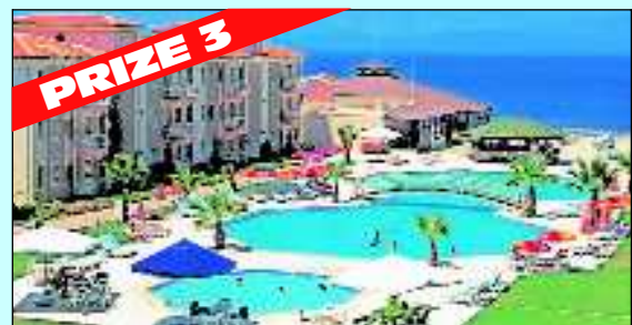
PRIZE 3 IDYLLIC: The four-star Palmin Sunset Plaza is stunning