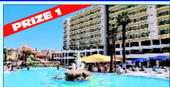
PRIZE 1 FABULOUS: The four-star Palmin Hotel in Kusadai, Turkey

Send in your poster for a chance of winning an amazing break to Turkey