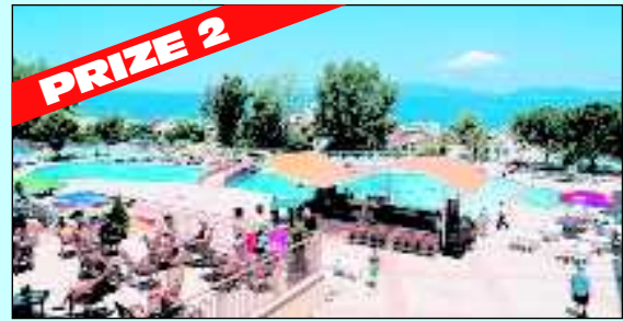
PRIZE 2 BEACHSIDE: The four-star Sea Pearl is an Irish favourite