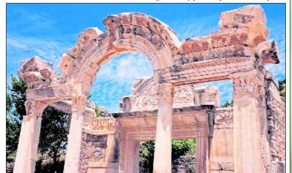
STUNNING: The ruins of Ephesus are considered one of the great outdoor museums of the world