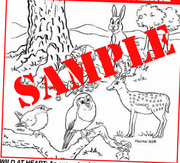
WILD AT HEART: An example of the wildlife poster free today

GET YOUR FREE POSTER IN THIS WEEK'S MAGAZINE