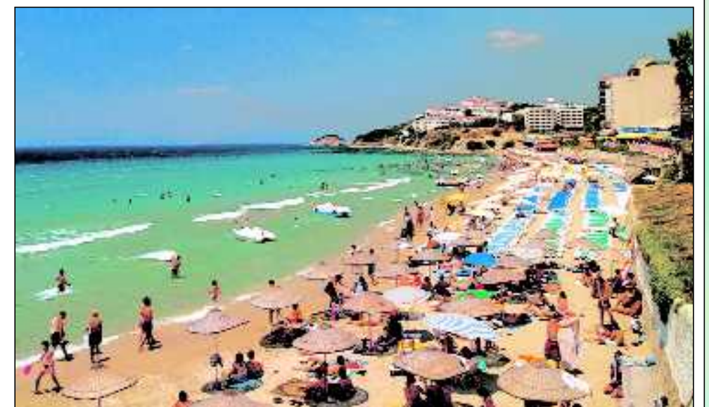
SCORCHER: The beautiful beach at Kusadai in Turkey, which enjoys 300 days of sunshine a year

Judges' decision is final and no correspondence will be entered into. No photocopies of posters accepted. Posters cannot be returned. Competition is open to all children up to 15 years of age.